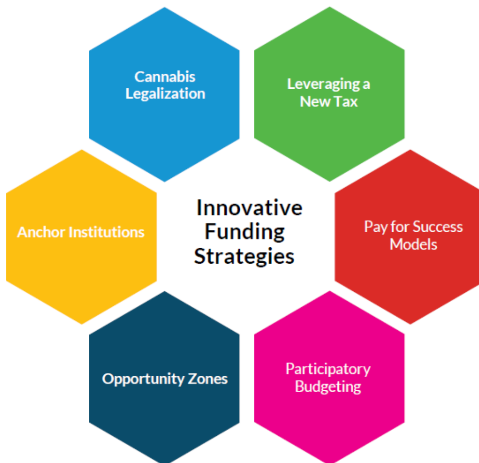
FIGURE 3 Innovative Funding Strategies

underinvestment in communities disproportionately impacted by incarceration has led residents to think even bigger and develop and implement their own solutions. Here we outline six outside-the-box strategies for redirecting existing resources to community priorities or generating new funds to support a continuum of care and opportunity for youth: leveraging a new tax, Pay for Success (PFS) models, participatory budgeting, Opportunity Zones, anchor institutions, and cannabis legalization.