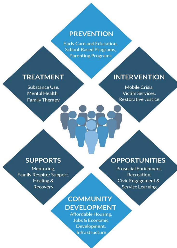
FIGURE 1 Continuum of Care